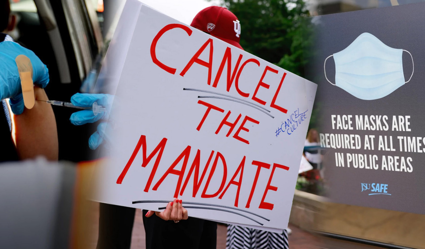
CHRONICLE ILLUSTRATION, PHOTOS FROM GETTY IMAGES AND AP IMAGES