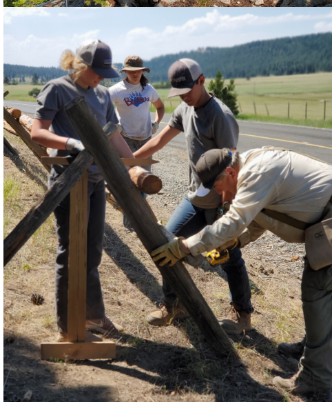
Student interns gain valuable career development in natural resources through a collaborative project on Oregon's Bull Run Creek, spearheaded by the REV Center.